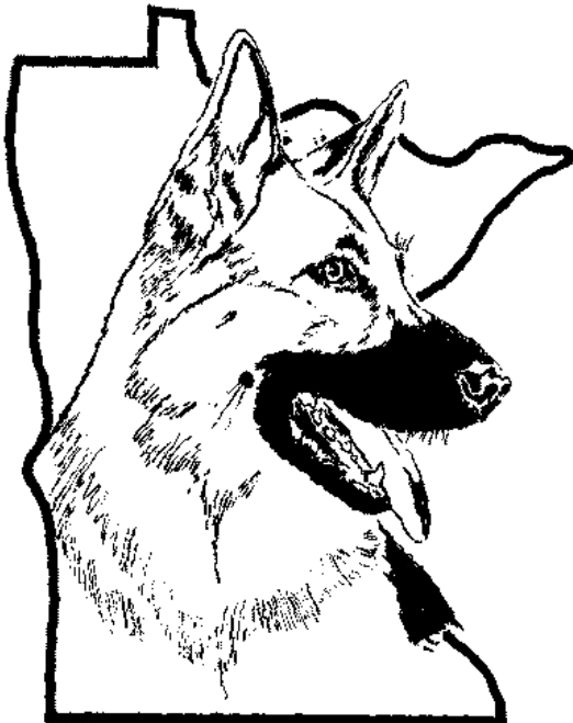
German Shepherd Dog Club of Minneapolis & St Paul

Shep-O-Gram 1087 Allen Avenue W. St Paul, MN 55118