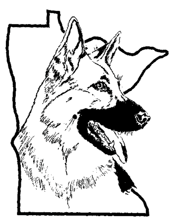
German Shepherd Dog Club of Minneapolis & St Paul

Shep-O-Gram 1087 Allen Avenue W. St Paul, MN 55118