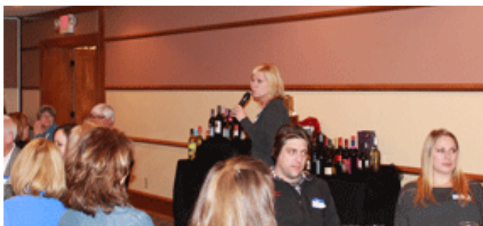
Wall of Wine