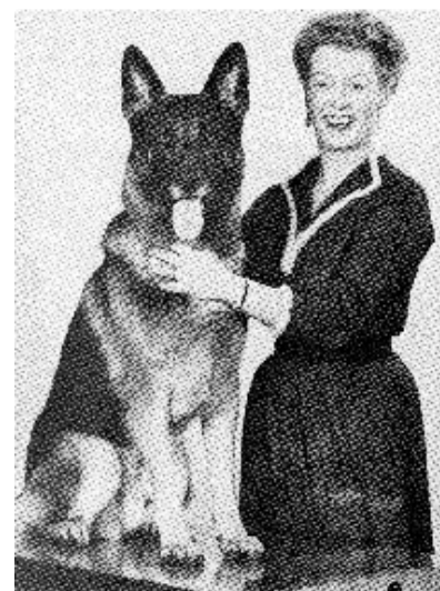
Ch Cuno von der Teufelslache SchH III FH, ROM