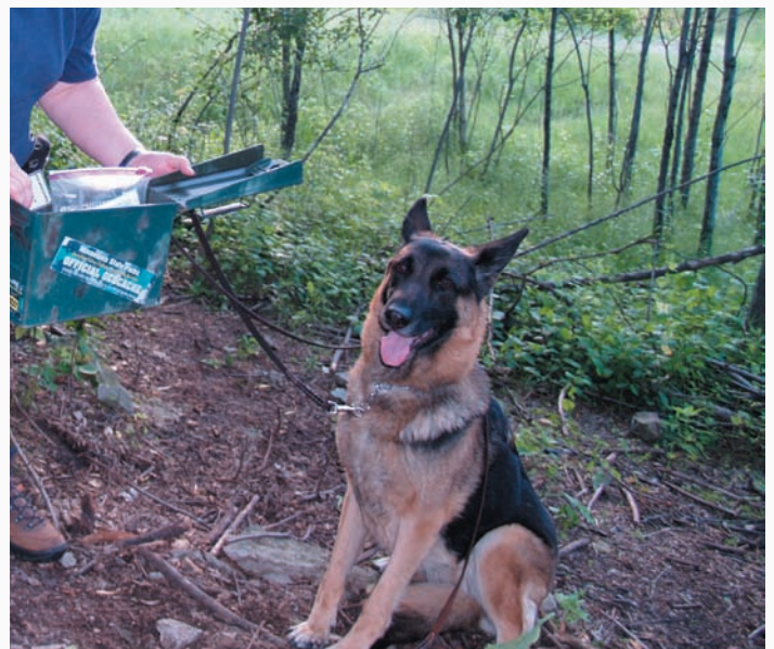
Xena and the cache box

A few days later Xena and I set out again to look for the cache, new batteries and about 10 spares just in case ( I was a Girl Scout- Be Prepared) and we headed out into the mosquito infested forest, this time with bug spray. We headed down a path to the Mississippi River. We must be getting close, we are almost to the water. Oops! It says the coordinates are about 550 feet across the river. Now I see why the GPS with the maps built in would be handy. We trekked back to our starting point and went off across the foot bridge. Soon we were at the location. It was by a small wall of rocks along the side of an embankment. We went up the rocks and down the rocks. Hmmm... it says to tread lightly, do you think a small explosive set here might be too much to use? Oh well, we didn't have any explosives anyway. We went up a path that faced the wall of rocks and stopped to think for a moment (about time we tried that!) . Xena started to growl. There was another intrepid explorer climbing down the rocks right in our face. He too was looking for the geocache and was not deterred by a growling German Shepherd. I