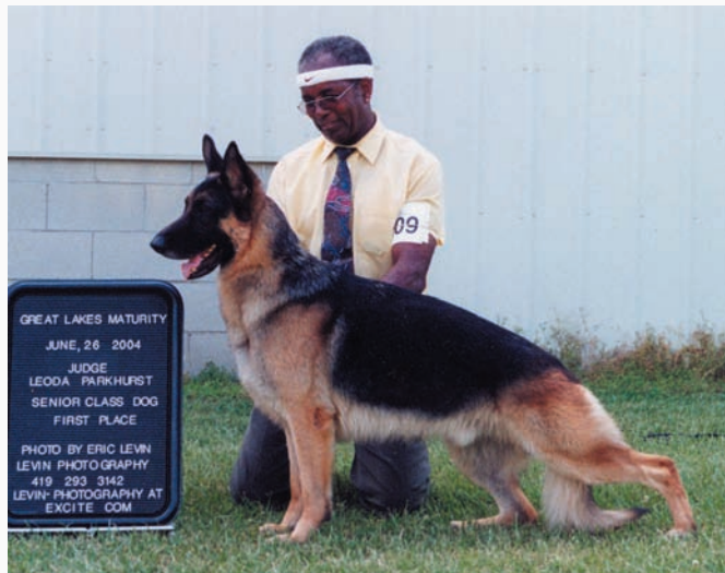
Ch Todor K-haus Dream Keeper RBOS Midwest Futurity 6/6/2003 BOS Great Lakes Maturity 6/26/2004