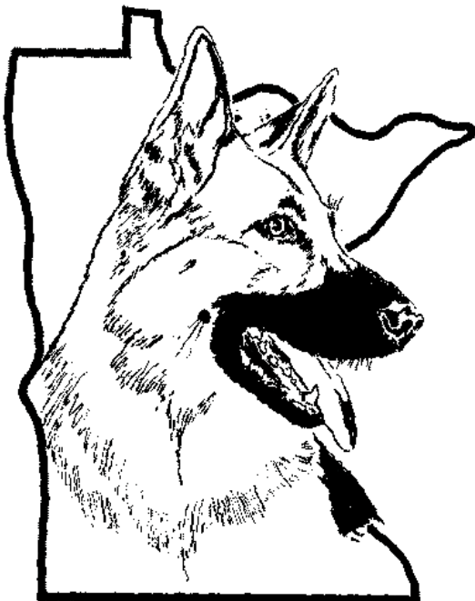
German Shepherd Dog Club of Minneapolis & St Paul

Shep-O-Gram 1087 Allen Avenue W. St Paul, MN 55118