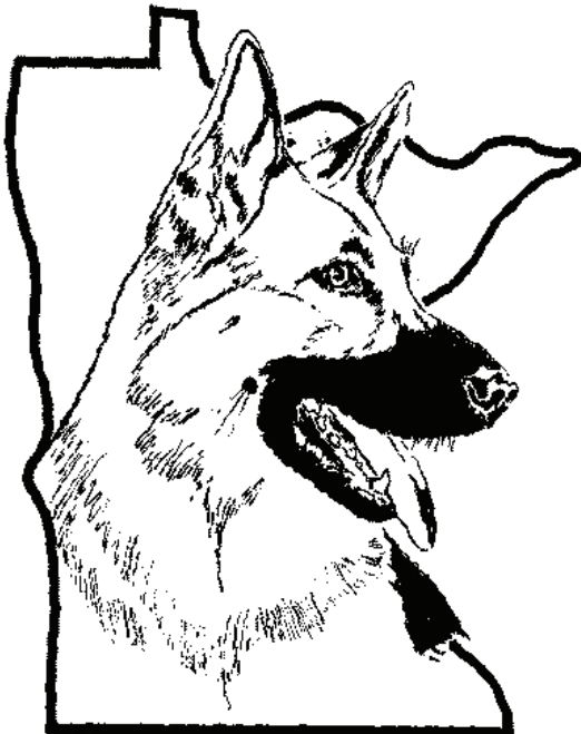
German Shepherd Dog Club of Minneapolis & St Paul

Shep-O-Gram 1087 Allen Avenue W. St Paul, MN 55118