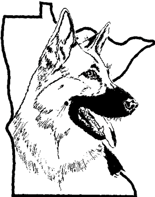
German Shepherd Dog Club of Minneapolis & St Paul

Shep-O-Gram 1087 Allen Avenue W. St Paul, MN 55118