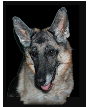
Black Forest Amelia Earhart RN, 2007 #10 Dam GSDCA ATAA, TC, 13 Club, OFA H&E Photo at age 15

Amy was an obnoxious puppy, acquiring the nick name of Little Escape Pod for her ability to get over or through any barrier as a young pup. She put a big rip in the living room carpet, but she matured and became a wonderful mother to her puppies, a great camping companion, and, when she finally settled down, at about 12, a great Rally Novice dog.