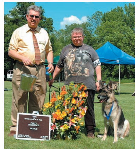
Winning Rally Novice at the GSDC MSP Specialty with a 99 out of 100 at age 13 1/2.