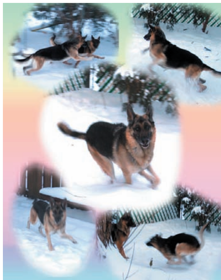
A collage of Amy at age 13 playing with her daughter Xena.