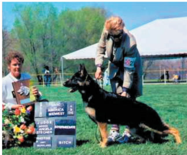
Domara's Feelin Groovy