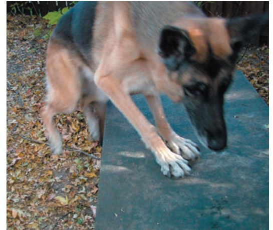
Gabby can now jump on the grooming table by herself