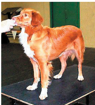
Figure 5 Just right - head has turned to the right, weight has shifted, left front foot is just about to lift. Weight is slightly to the rear so the back feet can comfortably stay where they are.