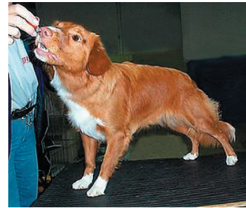
Figure 3 Pulling too far forward (nose toward A) - the dog is stretched and the left rear foot is lifting

Practice until the rear is well and truly anchored. You can move his front feet right or left with your lure, and the rear stays where you left it.