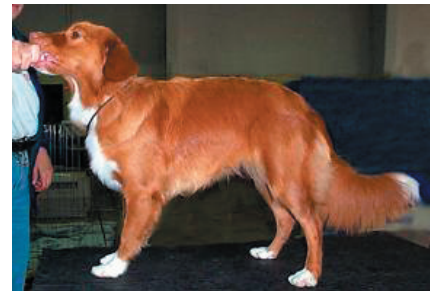
Figure 4 Pushing too far backwards (nose toward B) - the dog is hunching up. The right front foot is lifting and will move back instead of sideways