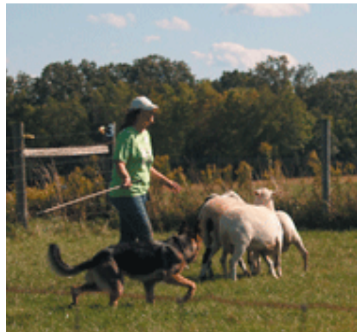
RiverRock's Straight From the Heart, Zoa Rockenstein