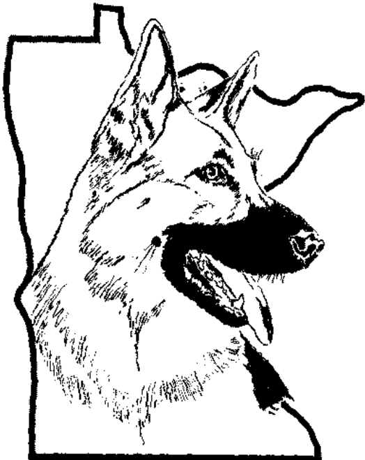
German Shepherd Dog Club of Minneapolis & St Paul

Shep-O-Gram 1087 Allen Avenue W. St Paul, MN 55118