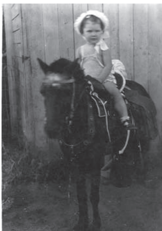
1938 2 1/2 yrs old