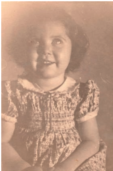
Doesn't she look like a little Shirley Temple?

IT'S HARD TO EXPLAIN CLOSE TO PERFECTION. "HARD TO DEFINE--BUT DEFINITE WHEN PRESENT" - Paul