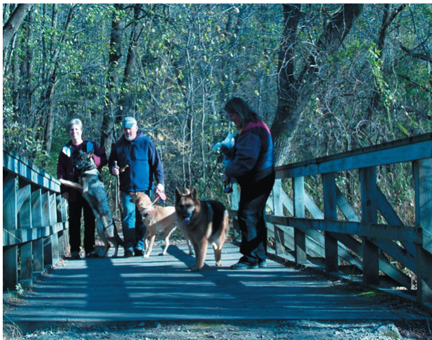
My Xena looking through the trees