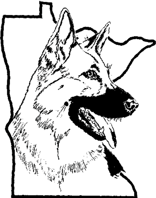
German Shepherd Dog Club of Minneapolis & St Paul

Shep-O-Gram 1087 Allen Avenue W. St Paul, MN 55118