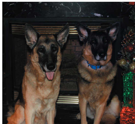
Gabby and Xena Christmas 2011