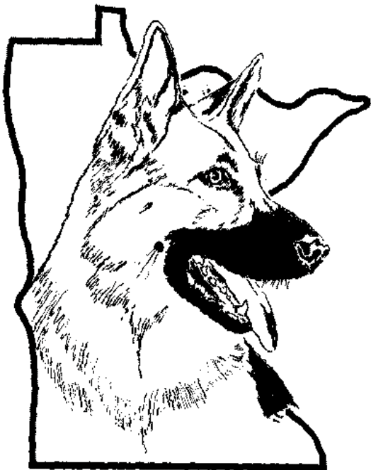
German Shepherd Dog Club of Minneapolis & St Paul

Shep-O-Gram 1087 Allen Avenue W. St Paul, MN 55118