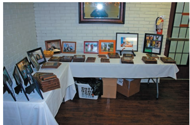
The Awards table