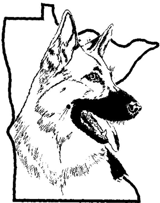
German Shepherd Dog Club of Minneapolis & St Paul