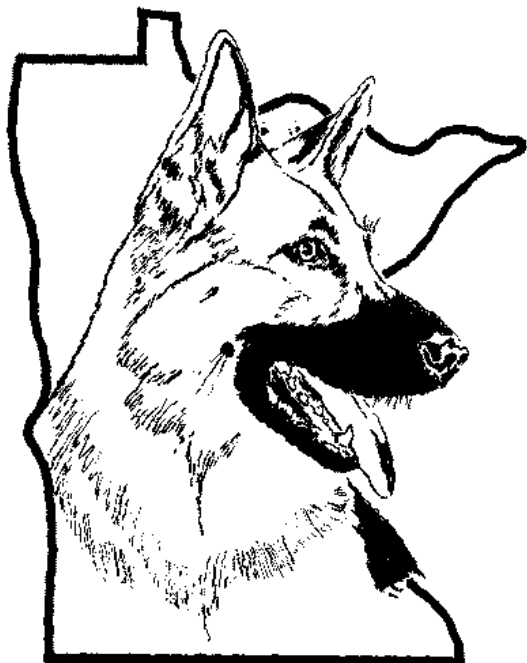
German Shepherd Dog Club of Minneapolis & St Paul

Shep-O-Gram 1087 Allen Avenue W. St Paul, MN 55118