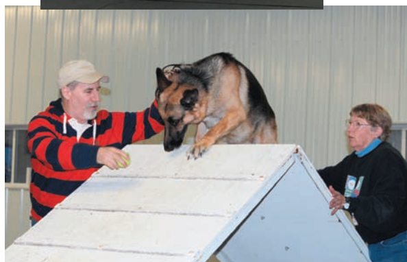
Luge does the A-Frame