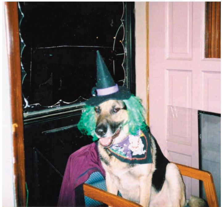
Ark in a witch's hat

As he grew up, he was very challenging to train due to his high drive. It is that high drive that would come to be both a wonderful trait and a problem. He helped me learn a lot about channeling energy to productive uses. After 2 super calm, couch potato dogs, it was fun not to have to figure out a new way to motivate a dog. He was always wound up. But by the age of two I realized I had a lot of work to do in teaching him to stop correctly. He stopped (always from a dead run) by jamming his front feet into the ground and letting his body and hind feet slide up to hit his front feet. I have a video of him at a show doing a fantastic sliding stop on a recall that would have been the envy of any cutting or reining horse. As a result, he tore his ACL at age 3; not an unexpected outcome given his sliding stops. His knee was never the same; but if there was a ball or a Frisbee to chase, he'd chase it. Even if he was on an obedience stay until released to "fetch it", once released he'd shoot after it and fly over the jump as if released from a sling shot. He was always up for whatever new adventure we had. Whether it was calmly greeting Llamas at a therapy animal test when he'd never seen a Llama or dancing with me at the Fair.