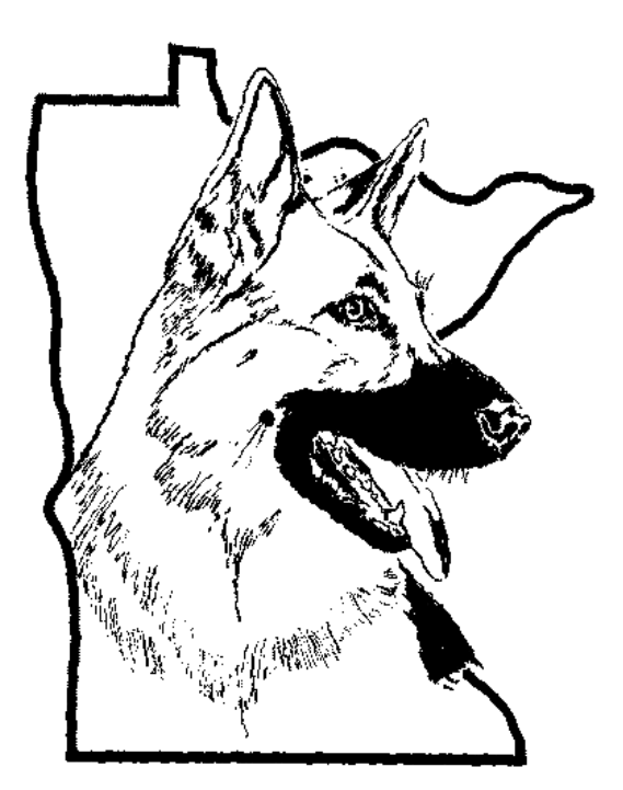
German Shepherd Dog Club of Minneapolis & St Paul

Shep-O-Gram 1087 Allen Avenue W. St Paul, MN 55118