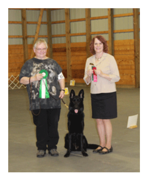
High Scoring also shown in Breed both days, Lindenhills Eywa Black Forest V Gracelyne IT, RN, CGC

Results can be found at <a href="http://www.gsdca.org/">http://www.gsdca.org/</a> Noframes/2014_Shows/GSDC_Minneapolis_St_ Paul.pdf