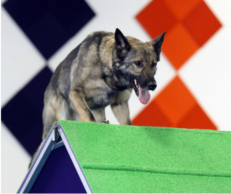
Jeanne Sutich's dog