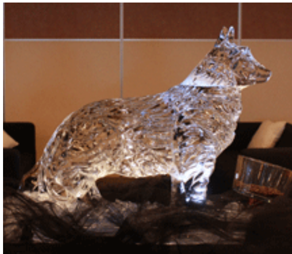
Life Size ice sculpture