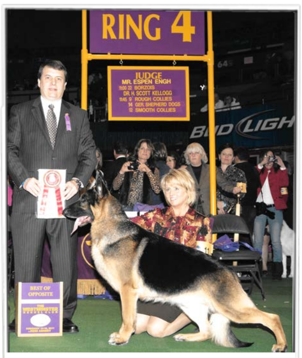
Gold Grand Ch. Canadian Ch. Mythical Zeus of Black

I think it was two years ago when she called me and told me she had end stage renal failure. She fought this deadly