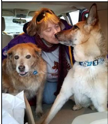
Hope and her adoptive "Mom", along with new family member, Ginger.