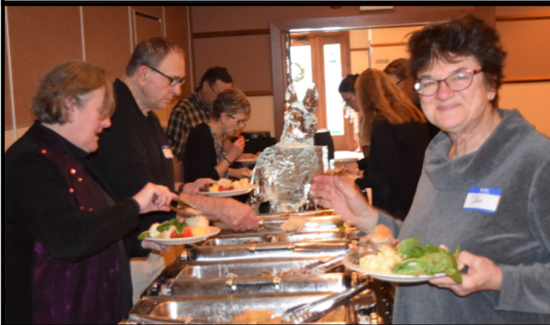
Members and guests enjoyed conversation and a sumptuous buffet.