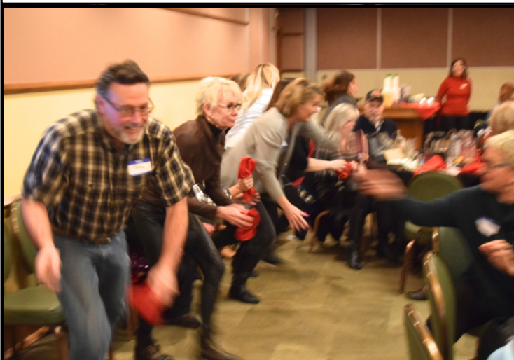
Mad scrambles ensued during a raucous post-dinner scavenger hunt.