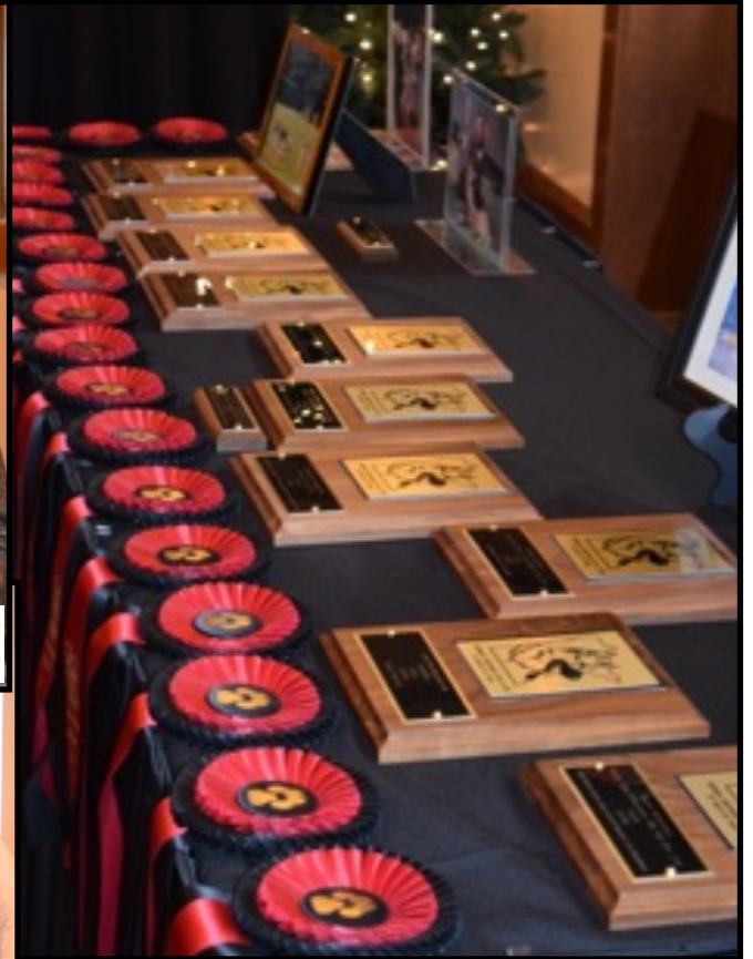
Awards presented to members for new titles earned in 2016