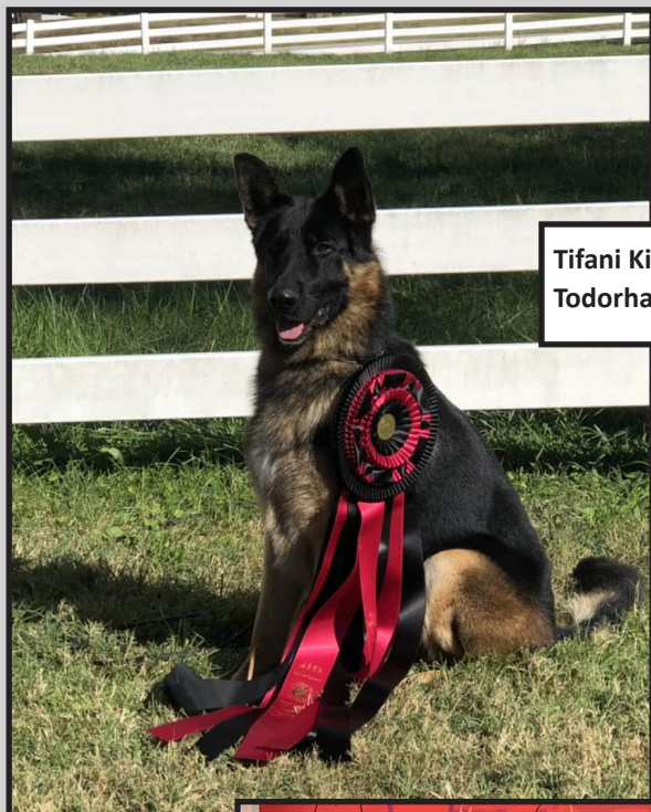
Tifani King Futurity Victor BPIS Todorhaus Blackhawk v Lutzhaus —