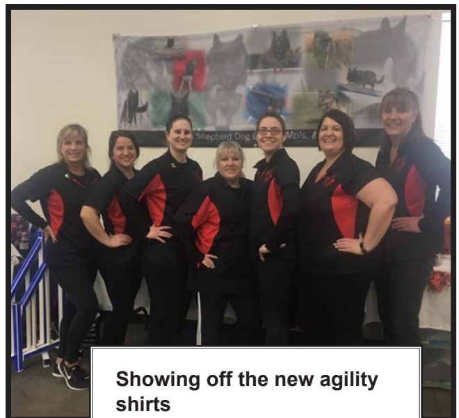
Showing off the new agility shirts