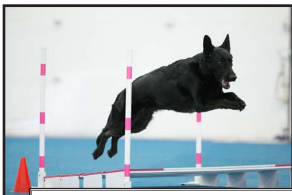
Eywa searched high and low for Q's to no avail