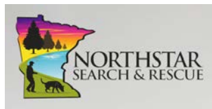
Demo of search and rescue