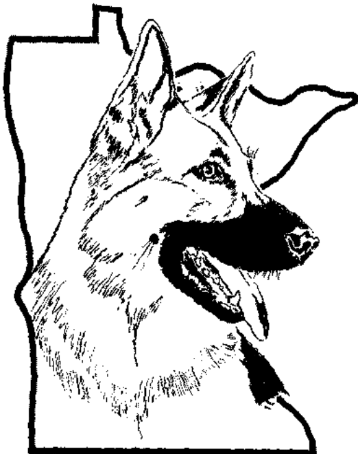
German Shepherd Dog Club of Minneapolis & St Paul

Shep-O-Gram 1087 Allen Avenue W. St Paul, MN 55118