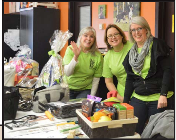
Raffle table team