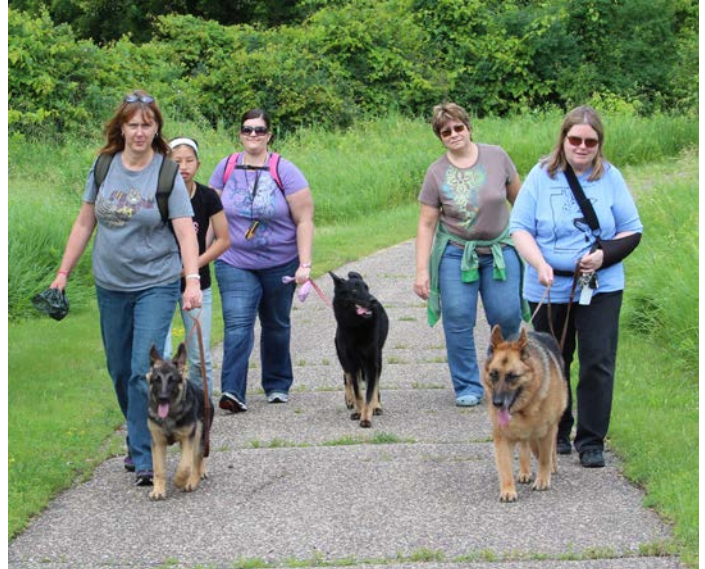
Geocaching at Afton State Park Several years ago.

You can find more information on the CGC test and the Canine Good Citizen Advanced or Community Canine, and the Urban Canine titles on the AKC website www.akc.org .