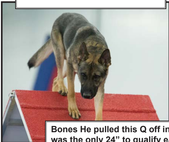
Bones He pulled this Q off in STD , was the only 24" to qualify earning him a 1 st place.