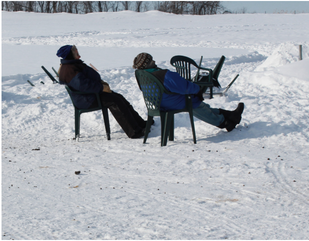
How we watch a herding lesson in the winter

If you are looking for events to watch or participate in you can find all AKC events on the www.AKC.org page. Select Events and pick the state or states you are looking for and the event type you want.