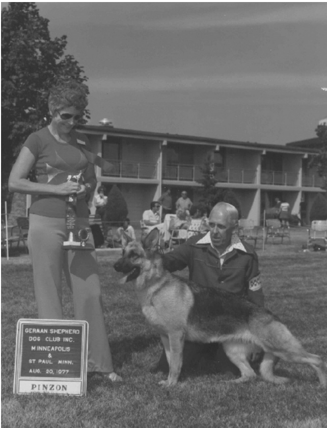
Chell and Ch. Patchell's Ruffian 1977