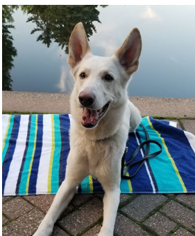
Shadowing practicing at Centennial Lakes

Helpful Hint #3: You have to have patience. Learning all of these exercises in different environments is hard. Only ask your dog what you know is achievable.