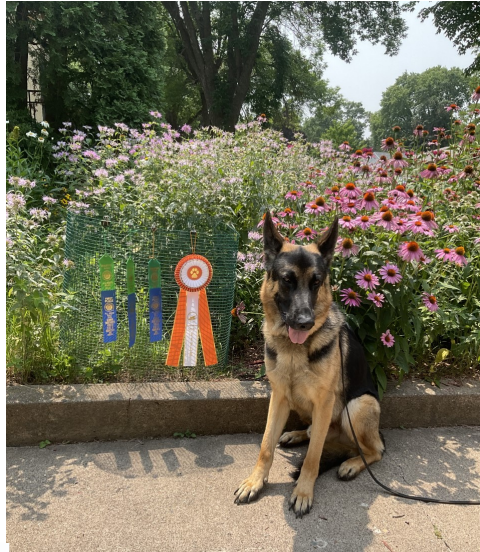
Templar's 1st rally trial ; July German Shorthair pointer trial ,3-1st place and his 1st rally title, scores of 85, 91, and finished with a 95 !