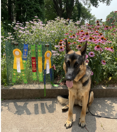
Templar's results from Golden Retriever club scent work trials July, 3-1st, 1-2nd, 1-3rd, 11 Q'