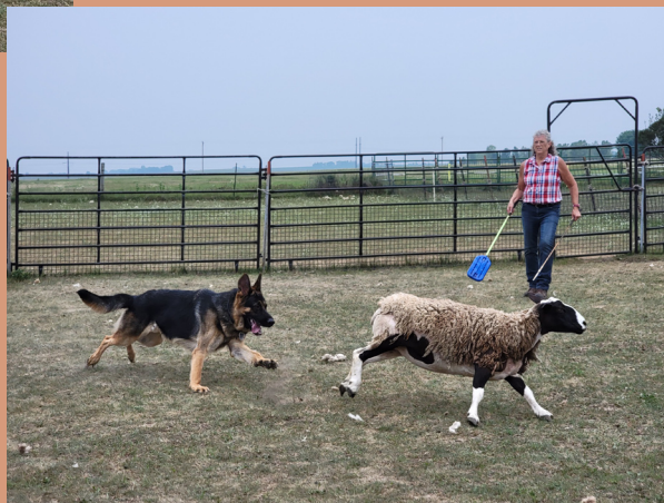
Sully in the Round Pen