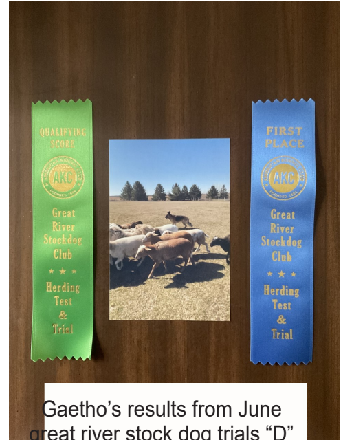
Gaetho's results from June great river stock dog trials "D" course