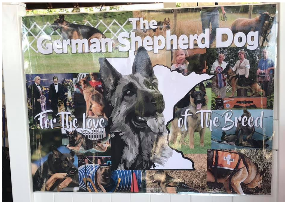
Banner from the State Fair

Check out the AKC.org website for articles on training. akc.org/products-services/training-programs/